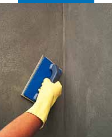
Finishing with sponge float