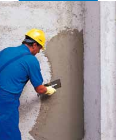
Application by trowel