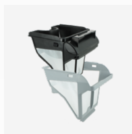
Filter canister Dual stage filter: 150/60 µ