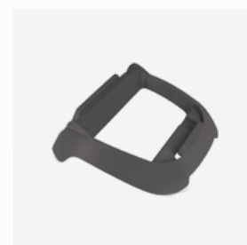
Base for the control unit