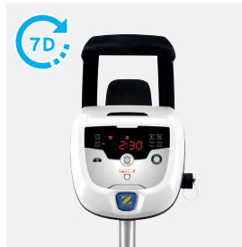
Control box Programmable for up to 7 days