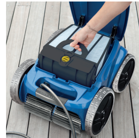
Filter canister Easy access and large capacity (5 litres)